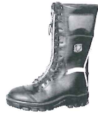
Lacing boot ref. 33326