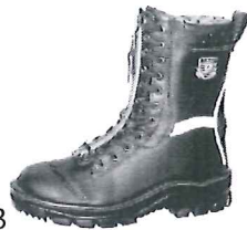
Lacing boot ref. 33323

4. Object of the declaration (identification of PPE allowing traceability; where necessary for the identification of the PPE, a colour image of sufficient clarity may be included):